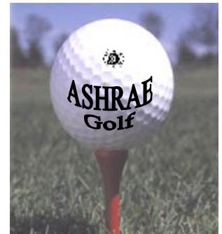
The Summer is Almost here and the means the 2007 ASHRAE Golf outing is right around the corner!

Also there will be "Hole Sponsors" available for each hole. The cost to be a "Hole Sponsor" is $200.00. If you are interested contact Greg Drensky ASAP.